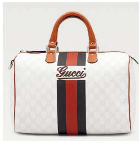
Gucci Handbag No. 120 Average Loudness Rating = 7 Price: $640