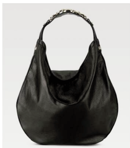
Gucci Handbag No. 170 Average Loudness Rating = 1 Price: $1,150