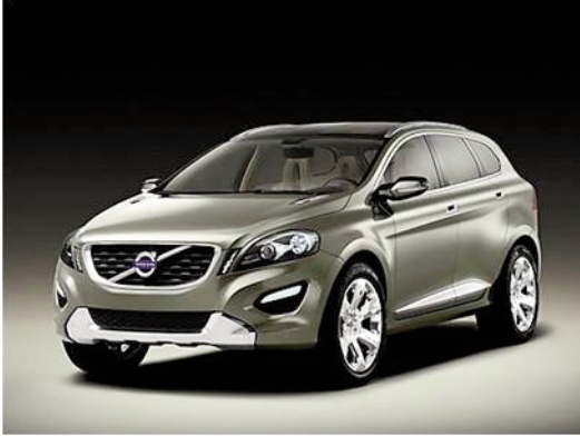
FIGURE 1 Volvo XC60 and Volvo XC90